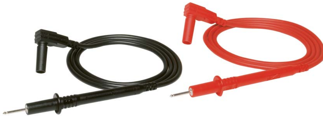
Test Leads included with MX50 Series