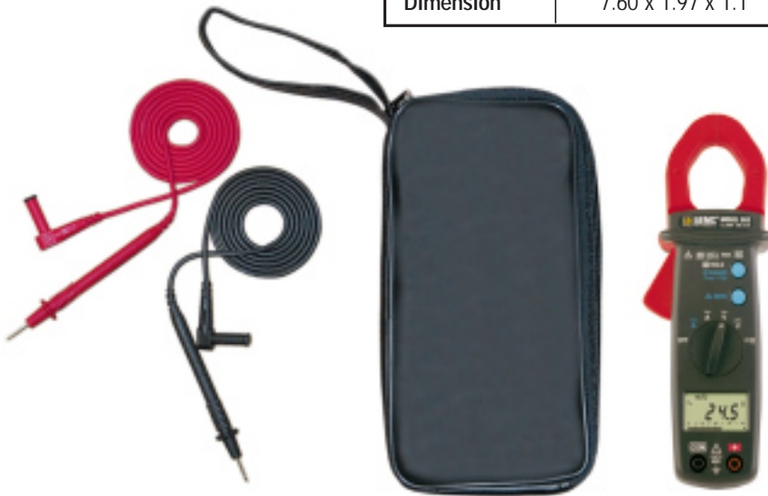
Models 501, 502 & 503 are supplied with a pair of test leads and soft carrying case